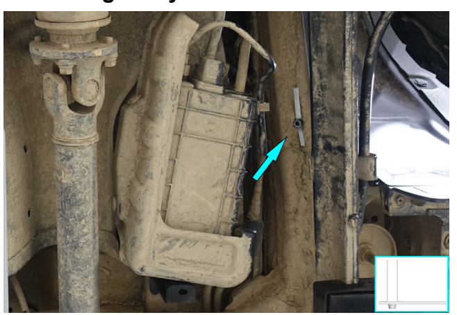
Fig. 8 8. Install insert nut M8 (item A) as shown in